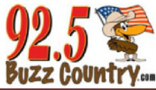
Exhibit 2.49 Copy of Listener Declaration(s)