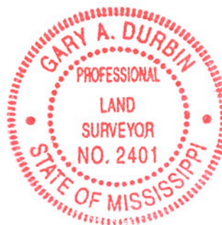
EXHIBIT #D APP. FOR STATION LICENSE JMD, INC. WZNF (FM) RADIO STATION CH 237CO - 100.0 KW (DA) LUMBERTON, MISSISSIPPI February 2008