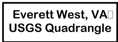
Exhibit 21.2 Topographic Map of Site 40-02-30 78-25-00 40-02-30 78-22-30 Snake Spring Valley Tussey Mountain West Providence Snake River State Game Lands No. 9 Proposed Site 40-00-00 78-25-00 40-00-00 78-22-30