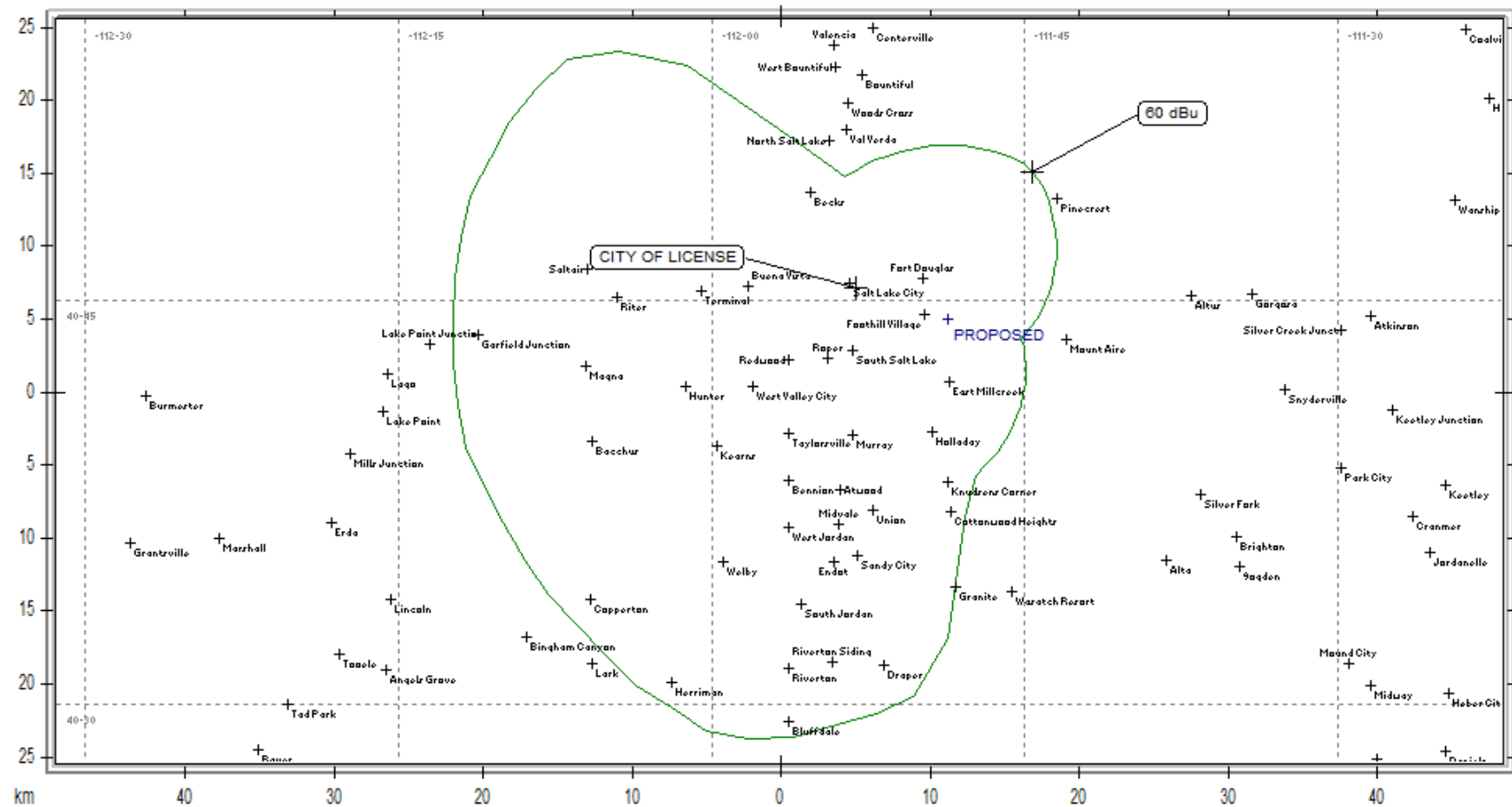
FIGURE 2: Coverage contours of the proposed station.