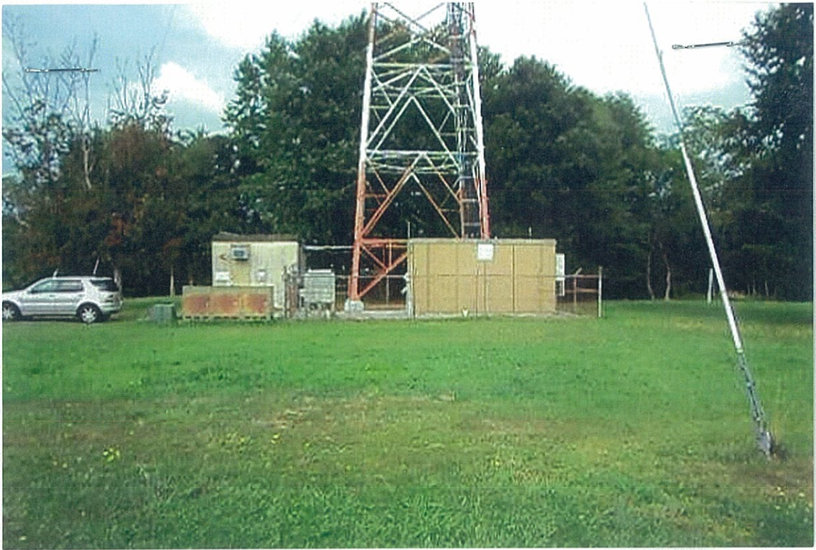
Exhibit Three Øver