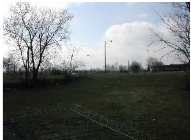
SOUTH SOUTH WEST