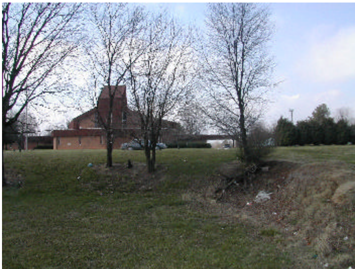
WEST NORTH WEST