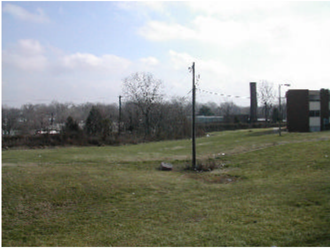
EAST SOUTH EAST