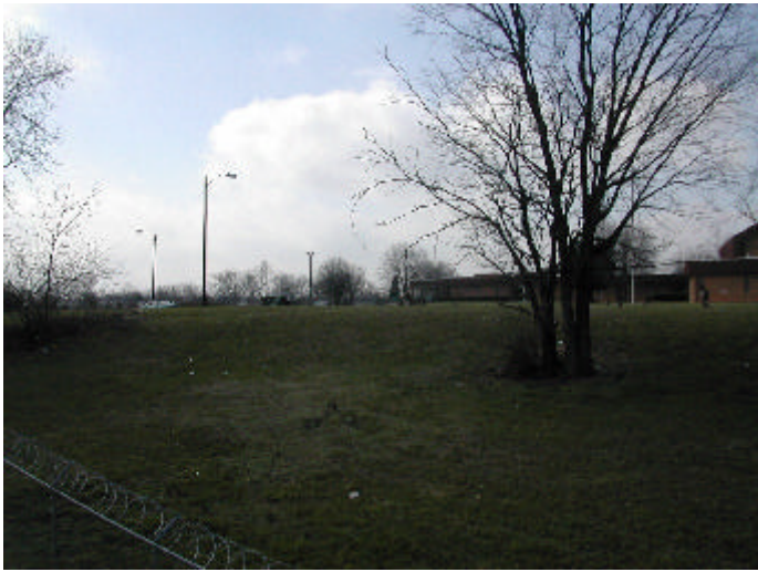
WEST SOUTH WEST