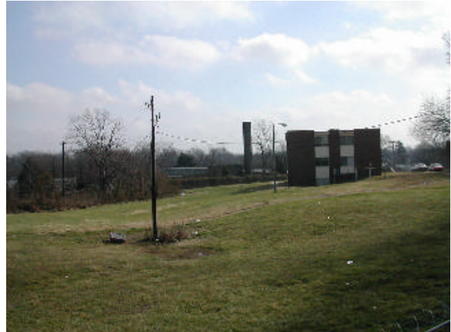
SOUTH SOUTH EAST