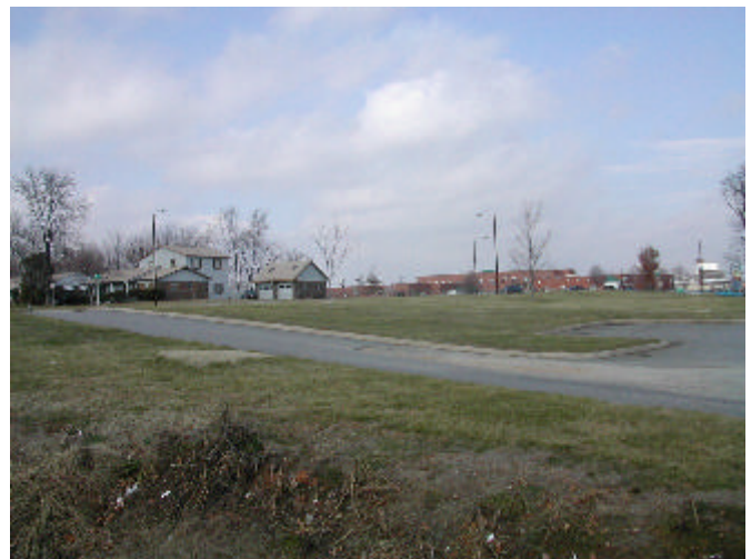
NORTH NORTH WEST