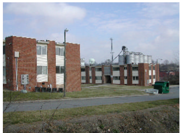
EAST NORTH EAST