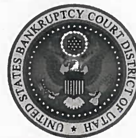
WILLIAM T. THURMAN U.S. Bankruptcy Judge