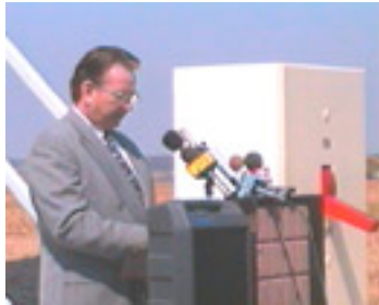
Gov Tommy Thompson

Average Wind Speed: 13.6 mph (at 110 feet)