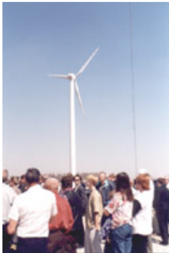
Guests at dedication