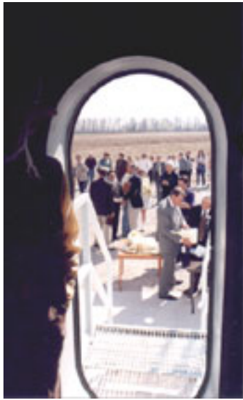
Inside turbine base

Annual Energy Output: 3,261,126 kilowatt-hours (gross total)