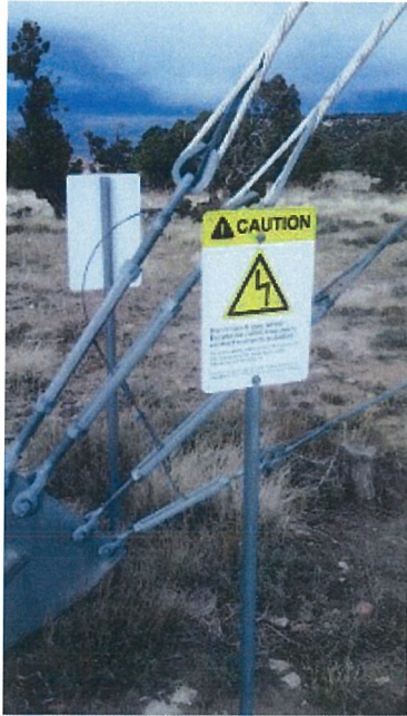
Fig. 4 Guy anchor hot spot signage

The overall RF field strength throughout the site averaged 20 to 30% of the Occupational / Controlled MPE. In several locations near guy wire anchors, RF field strength levels exceeded the 1000 \mu\text{W} / \text{cm}^2 limit for Occupational / Controlled Exposure. These hot spots were no larger than 10 x 10 meters and have additional warning signs posted (fig 4).