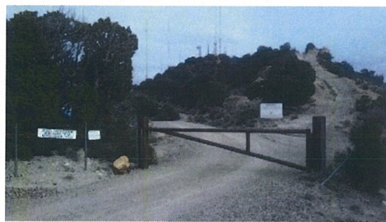
Fig. 2 Locked gate at site entrance