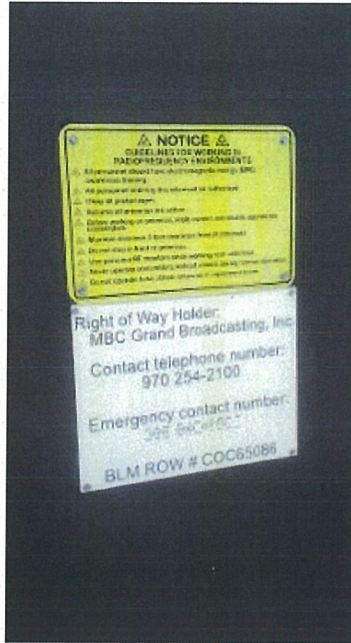
Fig. 5 Equipment shelter signage