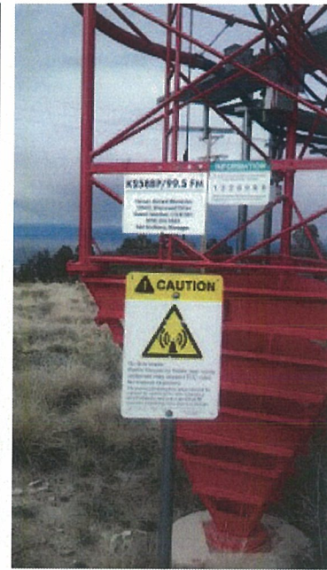
Fig. 6 Tower base signage

No area within the transmitter equipment shelter exceeded the Occupational / Controlled MPE. Nevertheless, warning signs are posted on the building entrance as well as at the base of the towers advising workers of safe working practices and possible RF exposure hazards in the vicinity of antennas on the tower. (fig 5, 6).