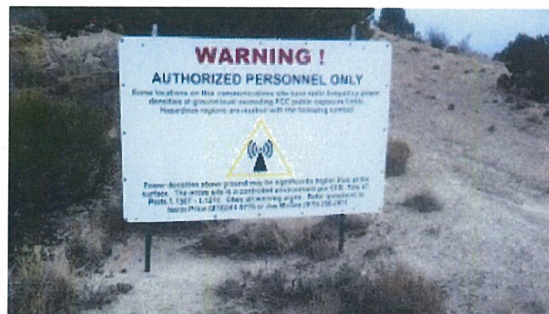
Fig. 3 Warning sign at entrance gate

The electronic site surveyed is located on a mountain top and is bounded on all sides by cliffs and steep rocky terrain. There are no public roads or foot trails near the site. The single access road to the site is secured by a locked gate (fig. 2). Warning signage has been posted at the entrance to the site (fig 3). Access to this electronic site is restricted to site users and there is no access to the general public. Therefore, the MPE for Occupational / Controlled Exposure apply to this area.