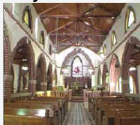
Historic Eben Ezer Chapel

There are numerous places of worship within Brush! city limits, and twice as many within the county.