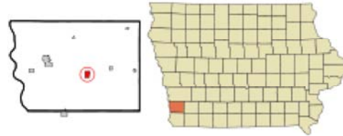
Location of Malvern, Iowa