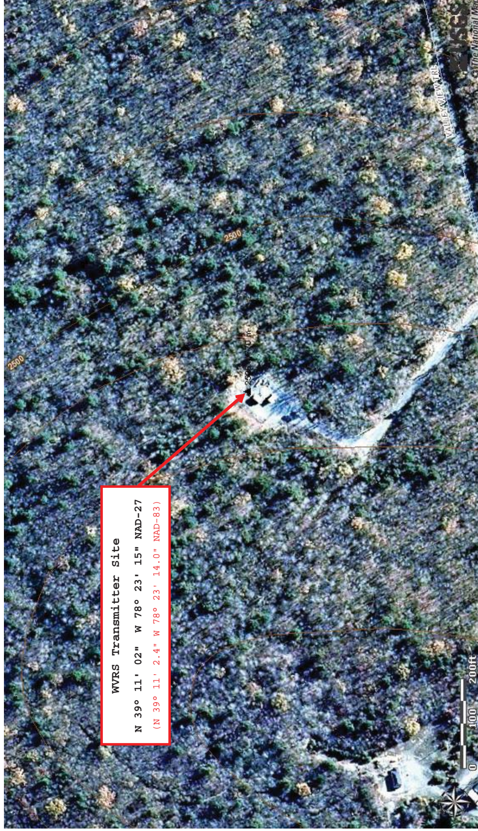
Exhibit 15.1(b) - Satellite Photograph Showing WVRS Transmitter Site

NOTES: Data available from U.S. Geological Survey, National Geospatial Program.