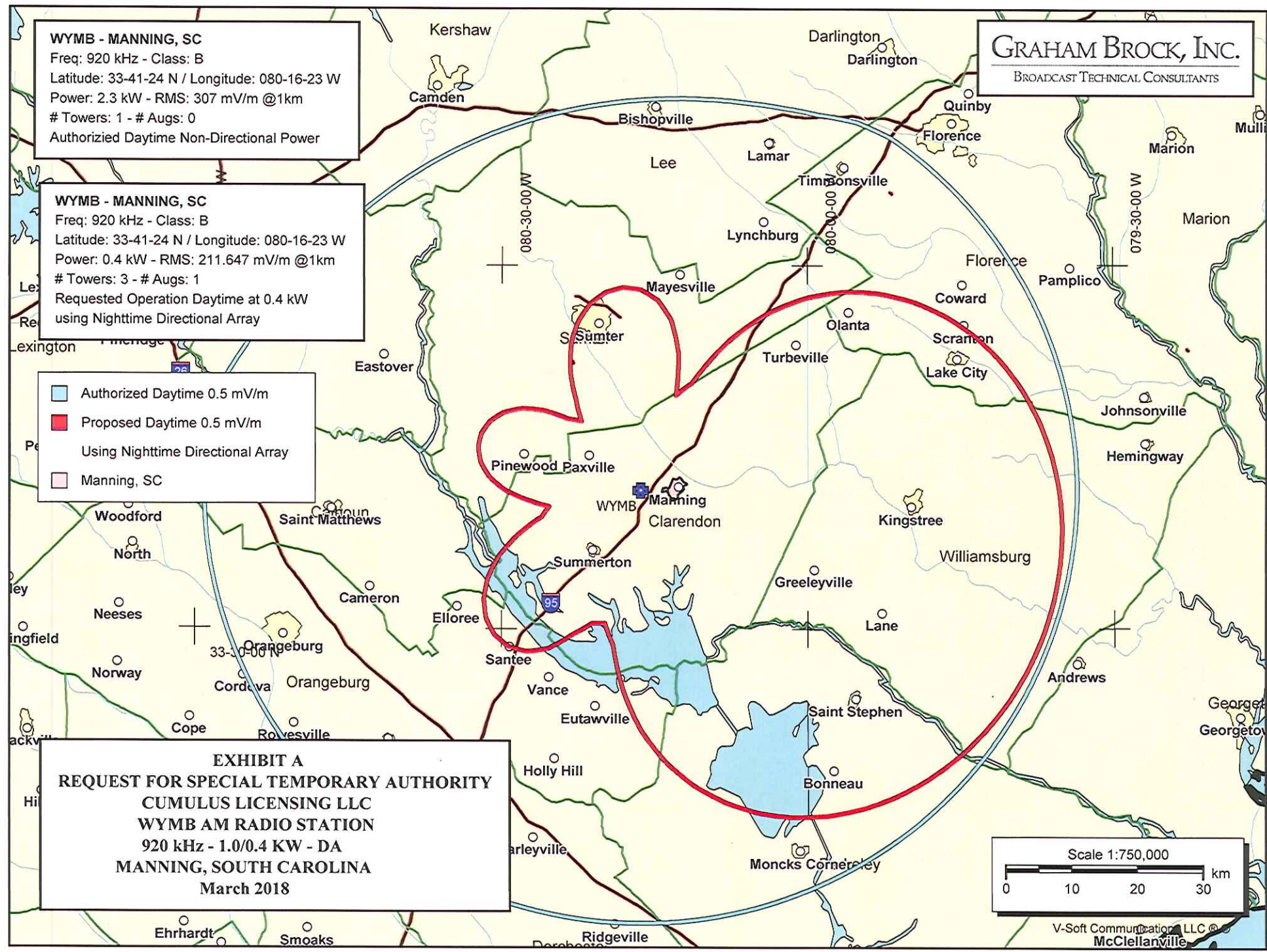
EXHIBIT A REQUEST FOR SPECIAL TEMPORARY AUTHORITY CUMULUS LICENSING LLC WYMB AM RADIO STATION 920 kHz - 1.0/0.4 KW - DA MANNING, SOUTH CAROLINA March 2018

Authorized Daytime 0.5 mV/m Proposed Daytime 0.5 mV/m Using Nighttime Directional Array Manning, SC