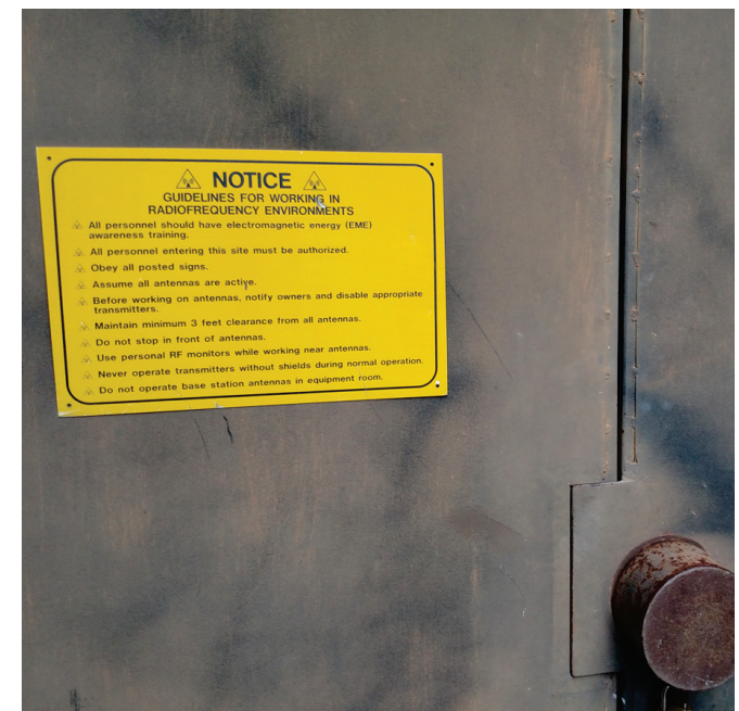
FIGURE 3 PHOTOS OF THE TUCSON MOUNTAIN COMMUNICATIONS SITE SHOWING THAT RF WARNING SIGNS ARE POSTED