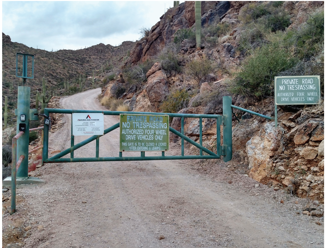
FIGURE 2 PHOTO SHOWING ACCESS ROAD TO THE TUCSON MOUNTAIN COMMUNICATIONS SITE IS RESTRICTED