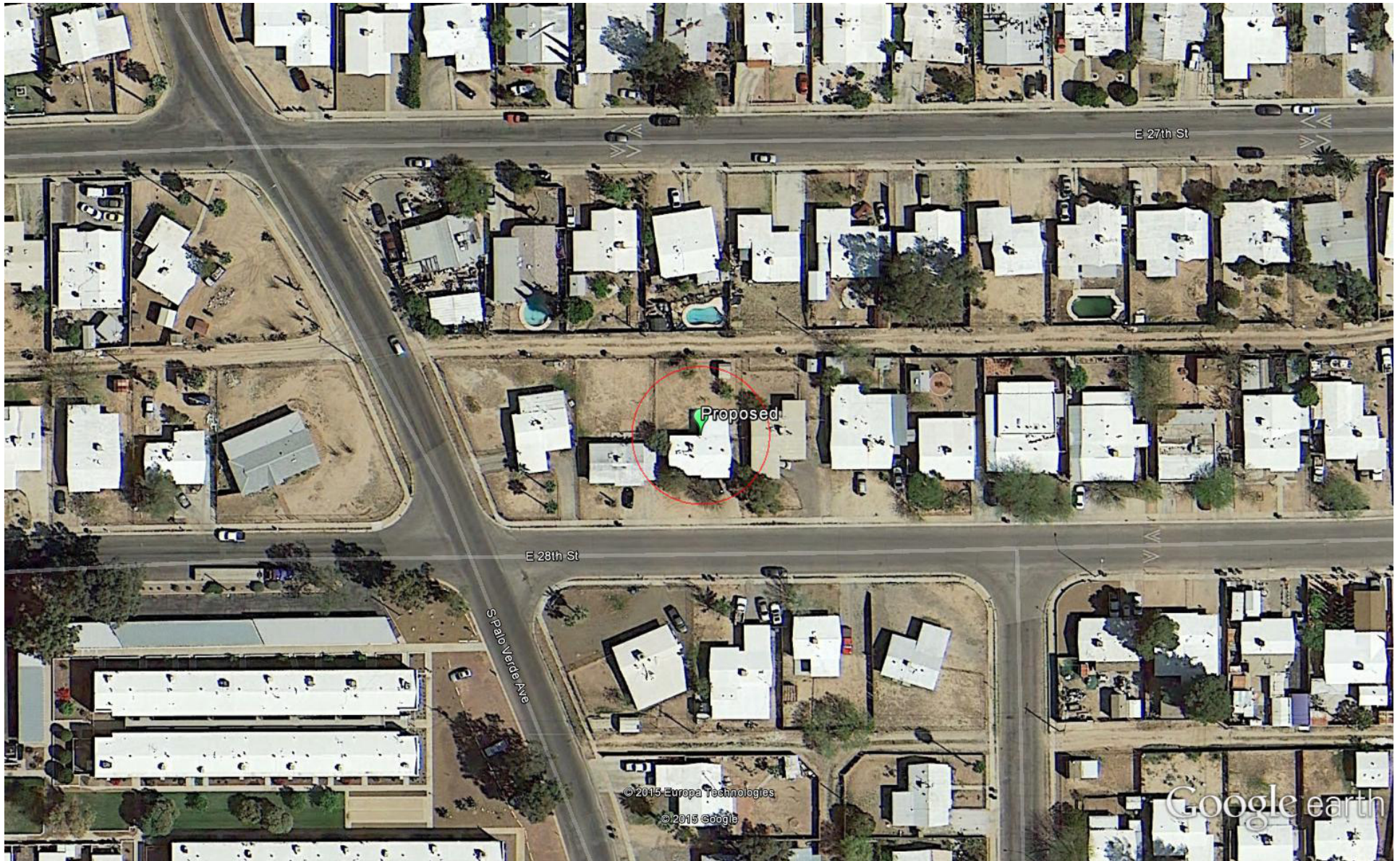
Exhibit 11 Figure 3 Aerial Photo of the Vicinity Surrounding the Proposed Tower Site