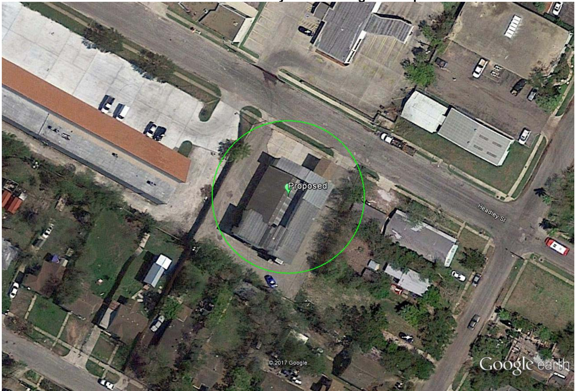
Exhibit 11 Figure 4 Aerial Photo of the 24.5 meter Vicinity Surrounding the Proposed Tower Site