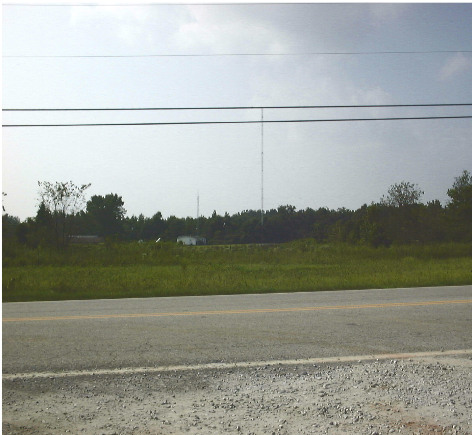
Fountain Inn SC tower site