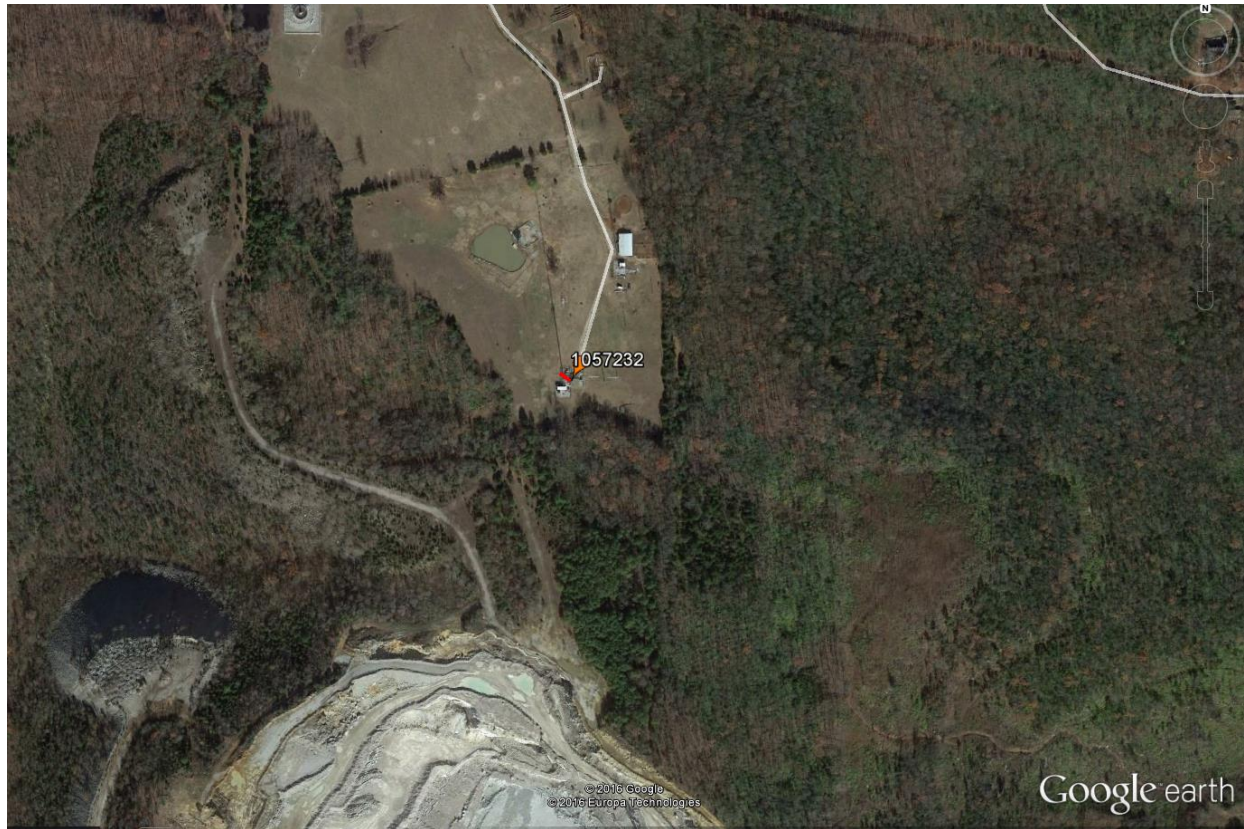
Figure 2. Proposed Location Aerial Image