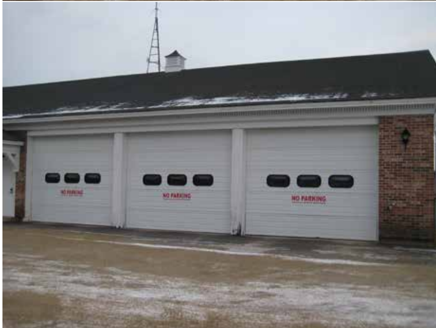
The Fire Department is also located in the Municipal Building.