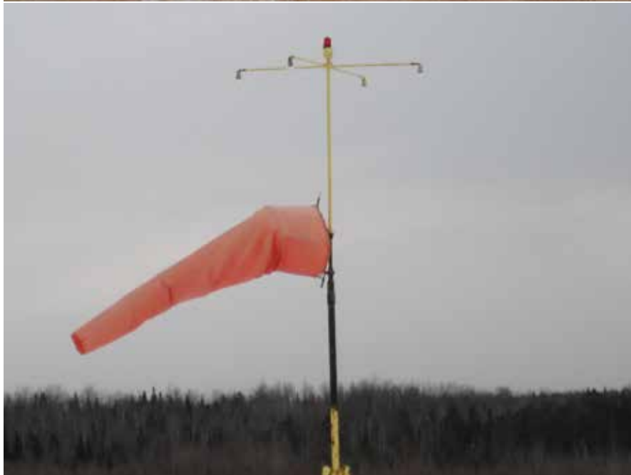
Wind Sock saves thrusting wet finger into the sub artic breeze!