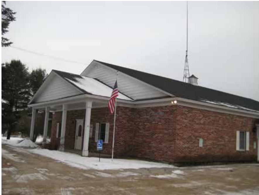
Milan has a modern Municipal building, housing town offices.