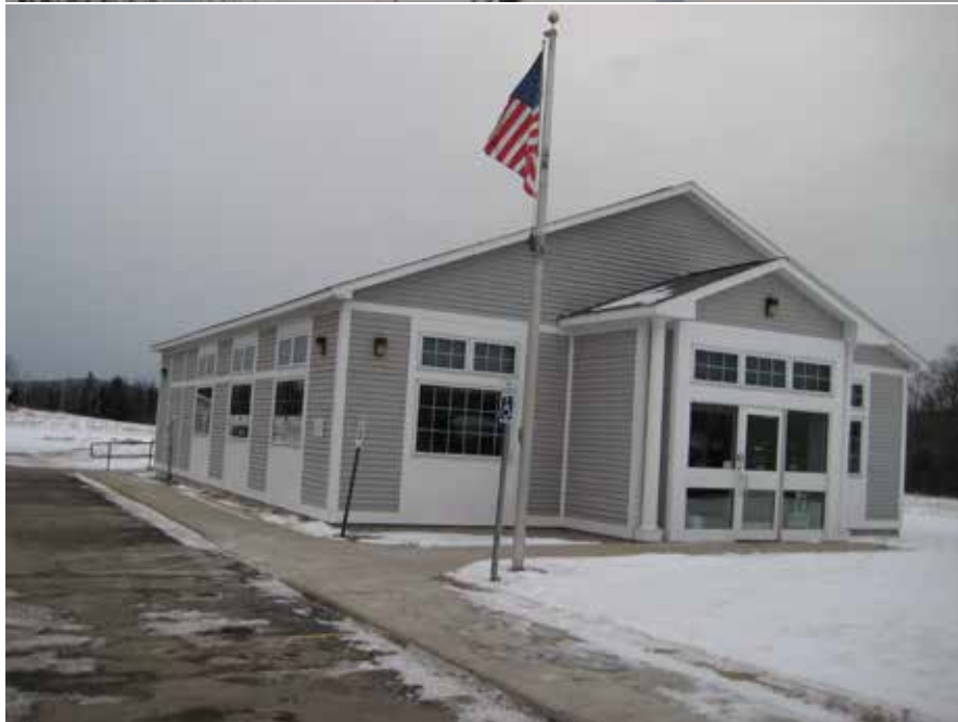
Milan also has a new Post Office Building.