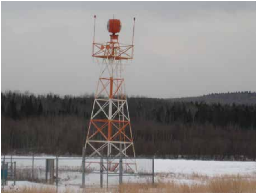
Rotating Airport Beacon