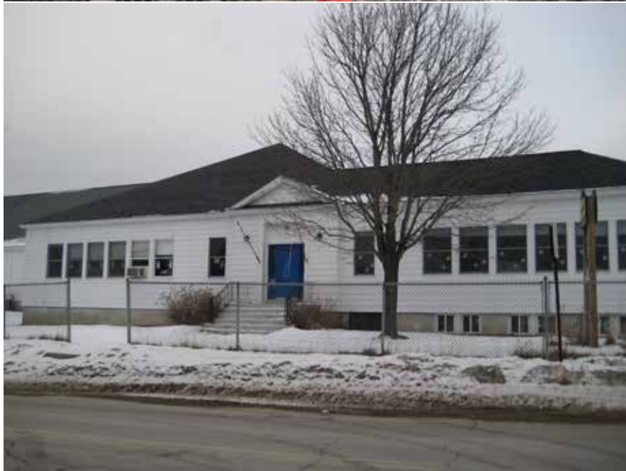
Milan elementary School. Grades K – 8. High School students are bussed to nearby Berlin.