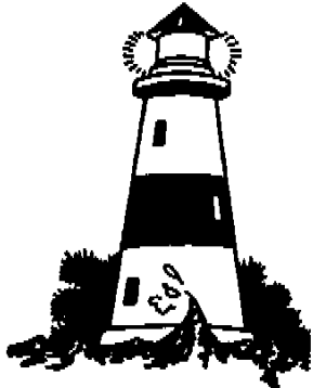
"The Lighthouse of the North"