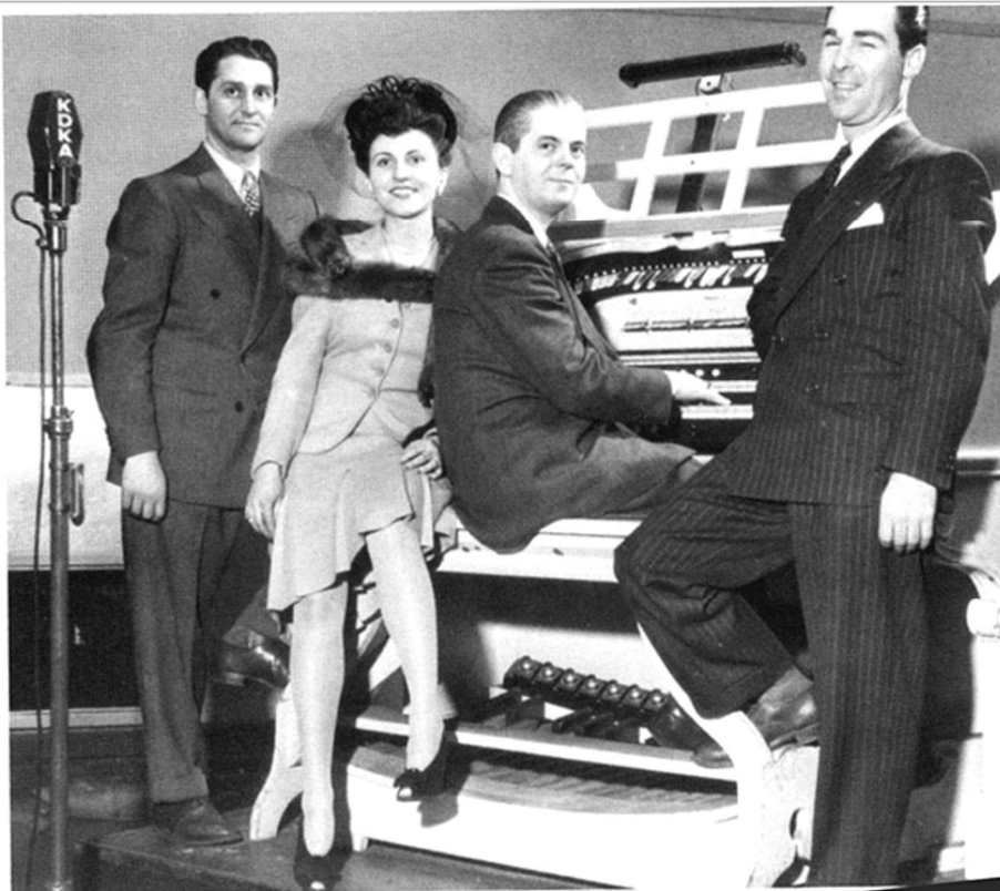
KDKA music staff gathered at the KDKA console.