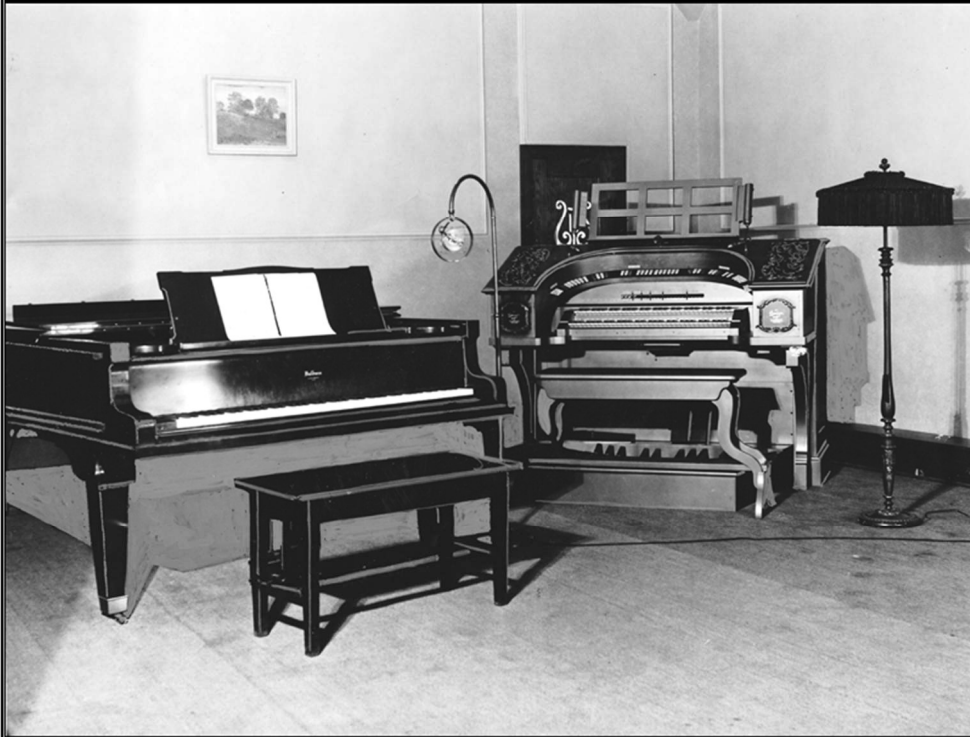
The photo is dated 7/28/1928 and

The history of theatre organs and broadcasting runs very deep and has mostly been forgotten. We intend to revive this and educate the public about the glory days when the organ was king.