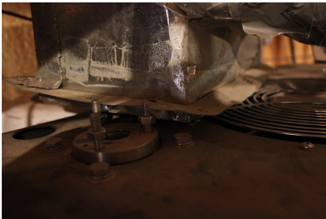
Exhibit 3 - KCOS-LP Transmitter Output Port