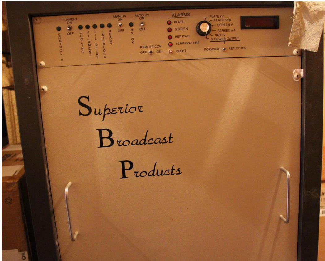
Exhibit 2 - KCOS-LP Inoperative Analog UHF Channel 28 TV Transmitter