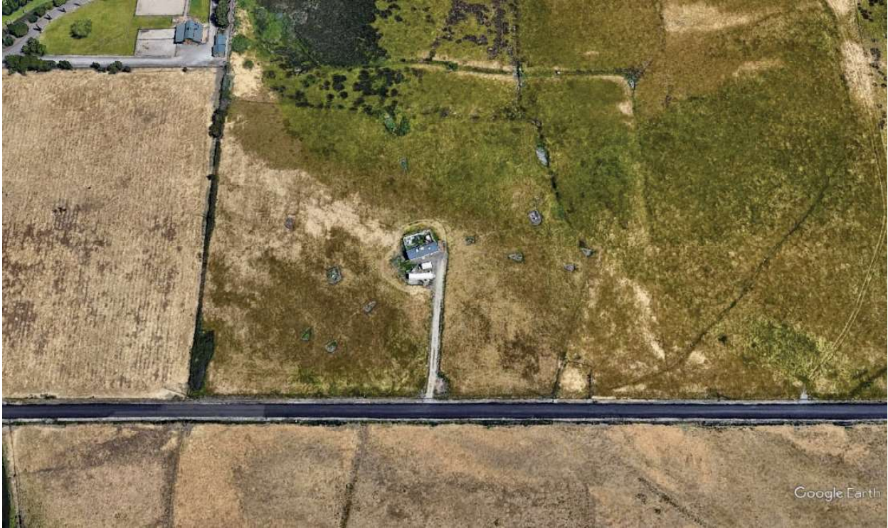
KDSO Transmitter Site Photograph