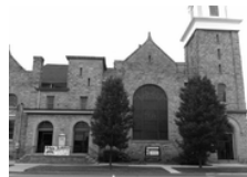
1st United Methodist Church