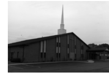
Christian Berwick Assembly of God Church