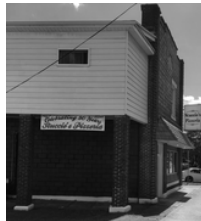
Stuccio's Pizza in Berwick, celebrating 50 years in business