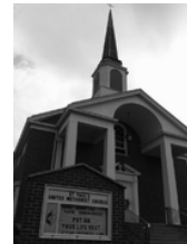
St. Paul United Methodist Church