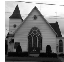
Seventh Day Adventist Church