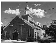
Holy Annunciation Orthodox Church, Berwick PA.