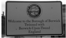
Berwick has a special relationship with Berwick-Upon-Tweed in England.