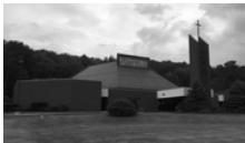
Immaculate Conception Roman Catholic Church