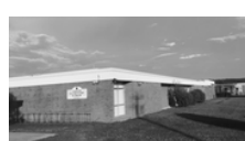
Salem Elemenatry School