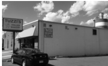
Tuzzi's Bakery, Italian family owned & local landmark.