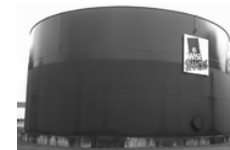
Water storage tank for Wise Snacks