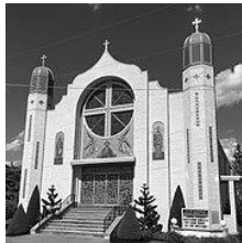
Saints Cyril & Methodius Ukrainian Catholic Church