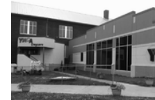
Army The Berwick YMCA, in a former school building