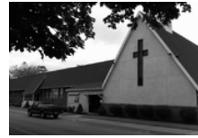
Fire Berwick Church