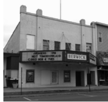
Berwick Theater, still showing films in 2017