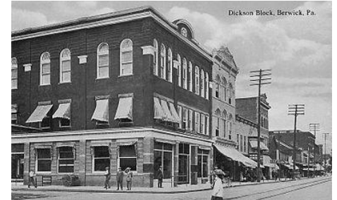
Dickson Block in 1912