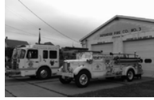
Defender volunteer fire company. The older engine for show and parades