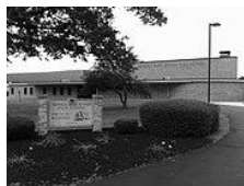
Berwick High School