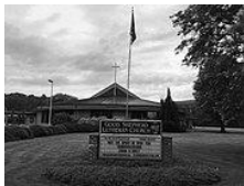
Good Shepherd Lutheran Church