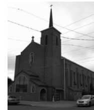
St. Joseph Catholic Church