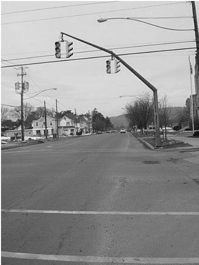
Market Street looking north