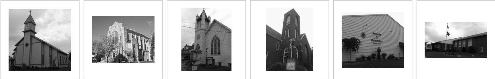
Grace Lutheran First Presbyterian Calvary United 1st United Church of Knights of The Elks club Church Church (PCUSA) Methodist Church Christ Columbus building