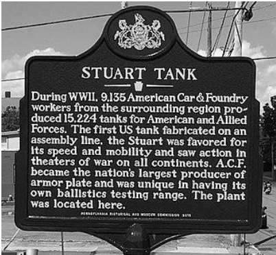
Marker for Stuart tank production