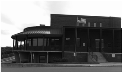
The Eagles Building