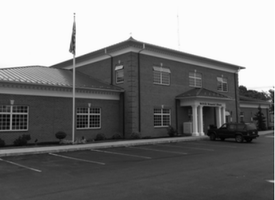
McBride Memorial Library