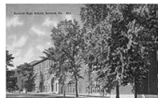
old Berwick High School, no longer standing