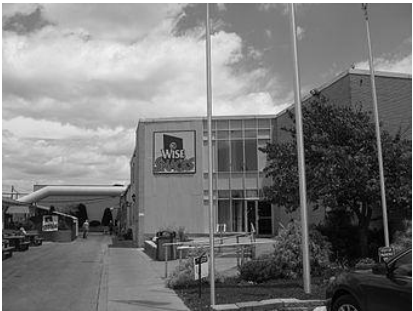
Entrance to the corporate headquarters and production plant of Wise Foods