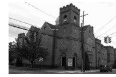
Bower United Church Memorial Methodist Church