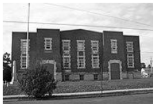
South end of armory