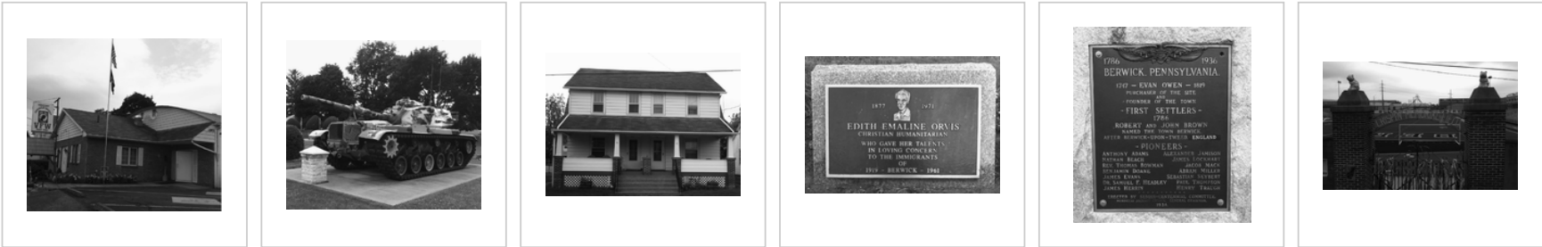
VFW post Army tank behind "Double house" Edith Orvis, who Founders of Berwick Crispin Field, home VFW post (duplex), one of many built in first half of 20th century came to help meet the social and needs of immigrants of the Bulldogs