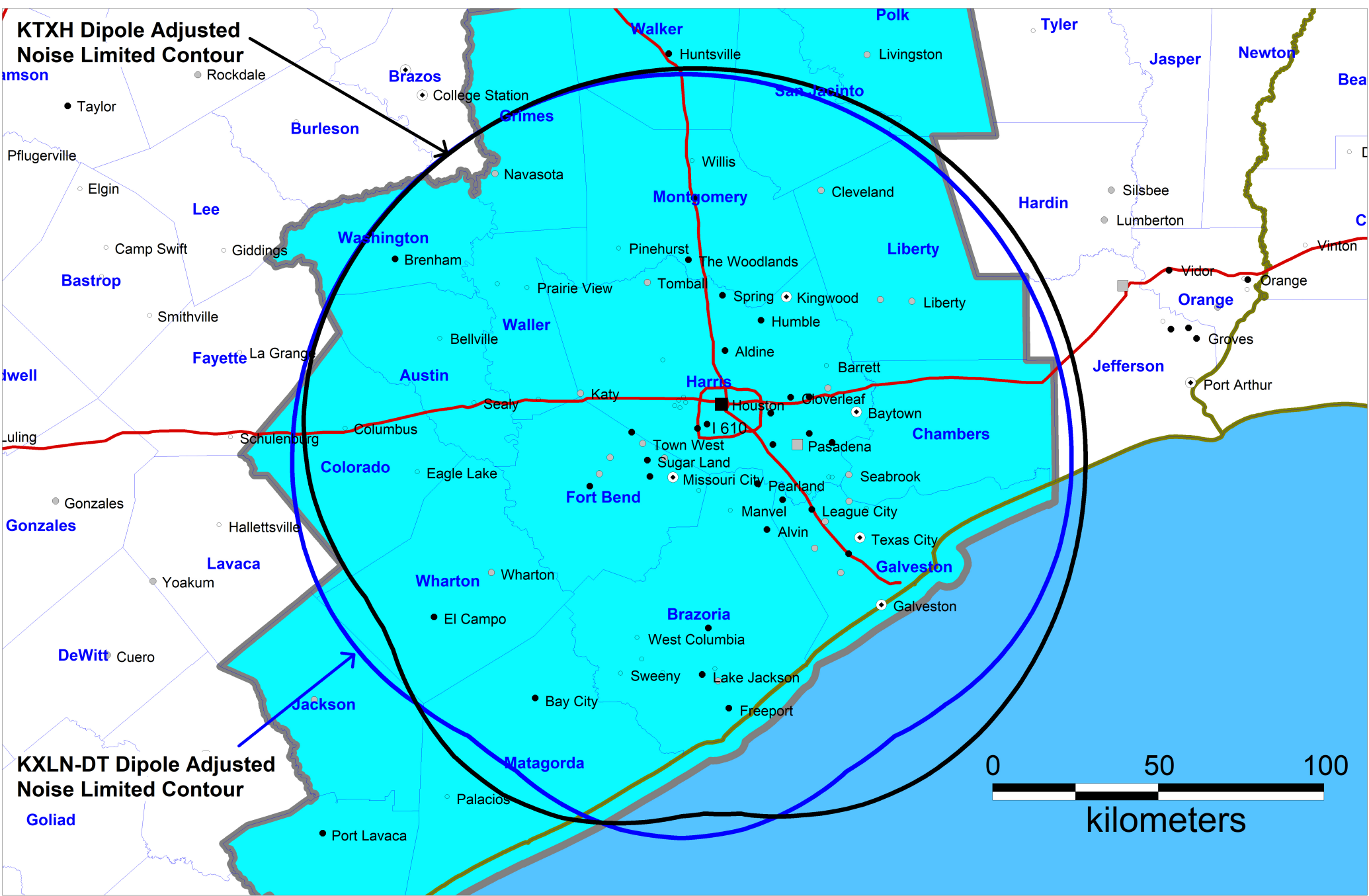
Coverage Contour Comparison KTXH Licensed Ch 19 Houston, TX ERP 1,000 kW HAAT 595 m Directional Antenna ATSC 1.0 Host KXLN-DT Licensed Ch 30 Rosenberg, TX ERP 1,000 kW HAAT 592 m Directional Antenna