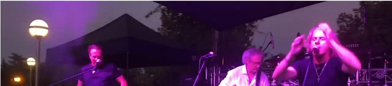
Pablo Cruise at Ros...