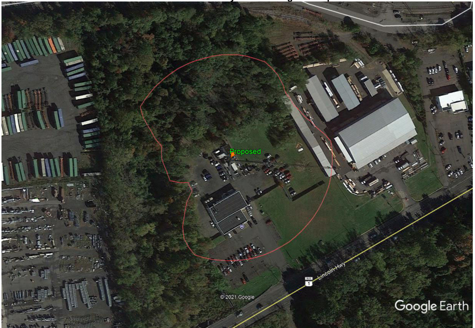
Figure 4 Aerial Photo of the 90.5 Meter Vicinity Surrounding the Proposed Tower Site