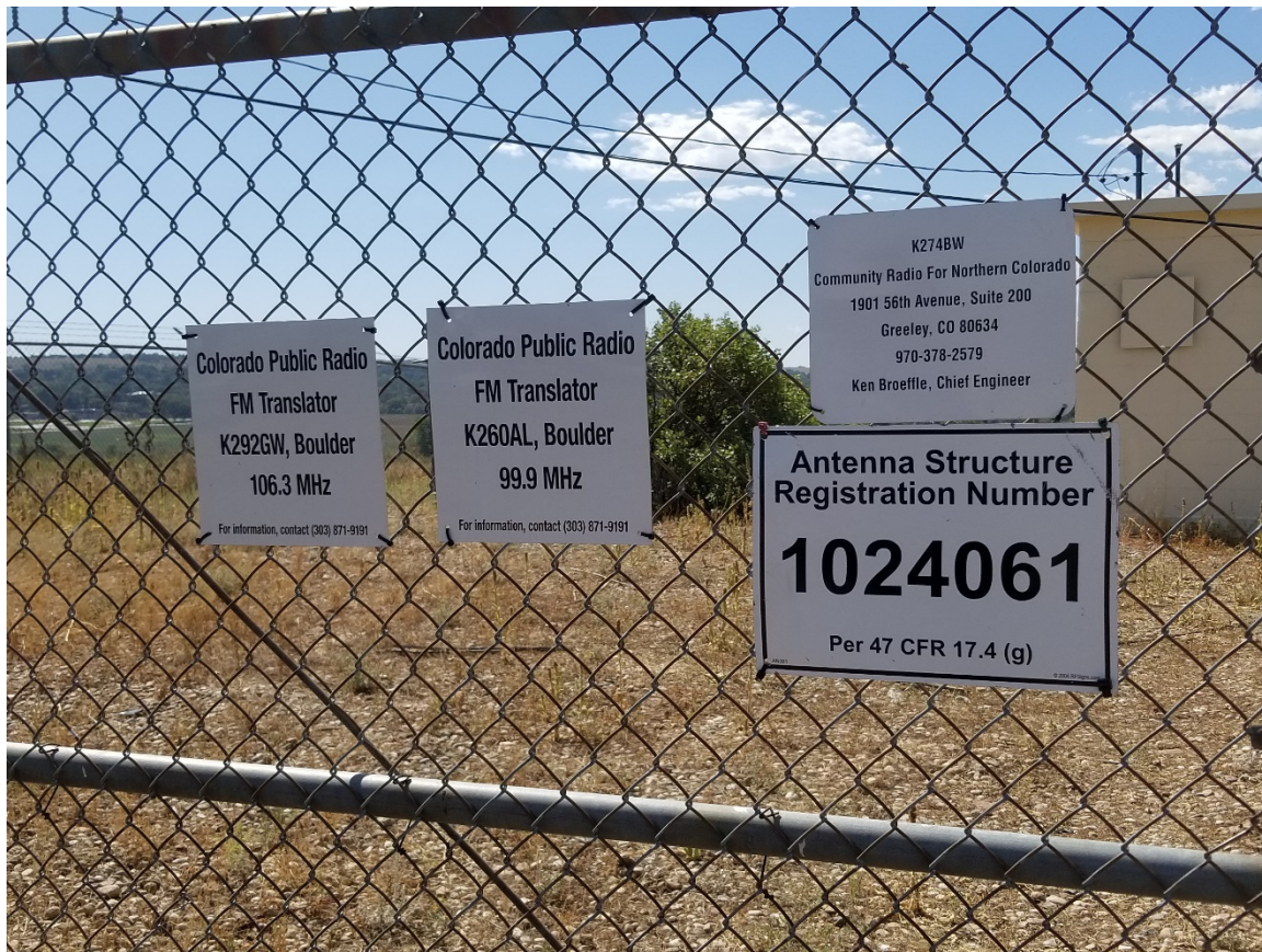
Site 2 Antenna information Current owner Mauna Towers, Loveland, CO.