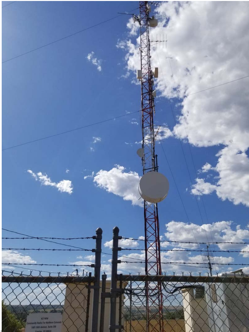
Site 2 Current antenna configuration on the tower, with no LPTV antenna, STL, or associated equipment installed.