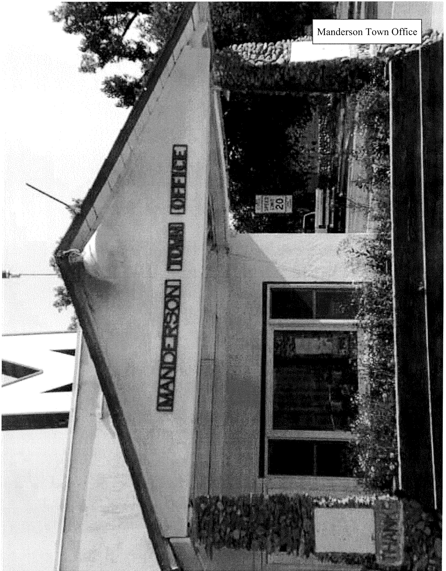
Manderson Town Office