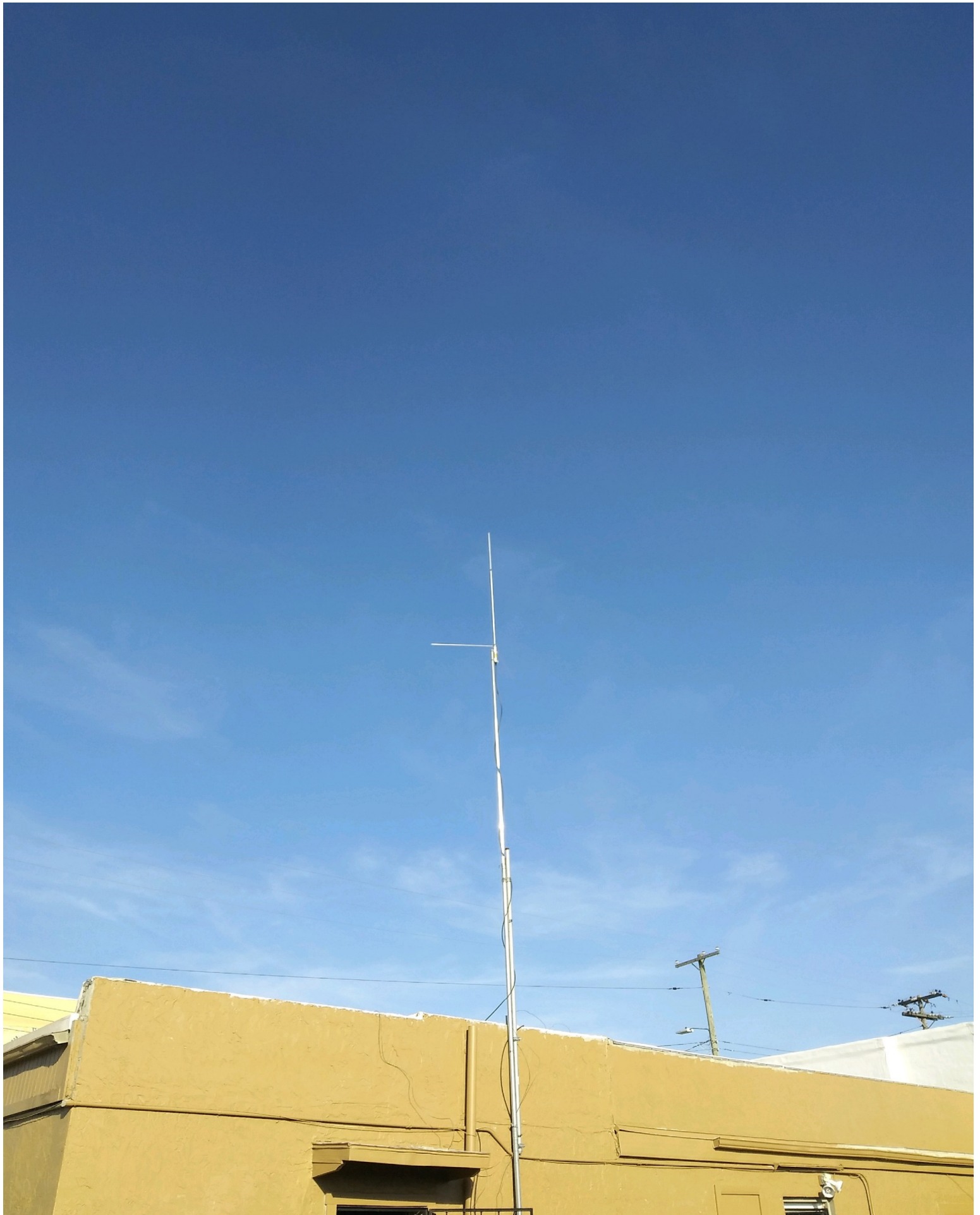
WURK-LP PERMANENTLY INSTALLED ANTENNA