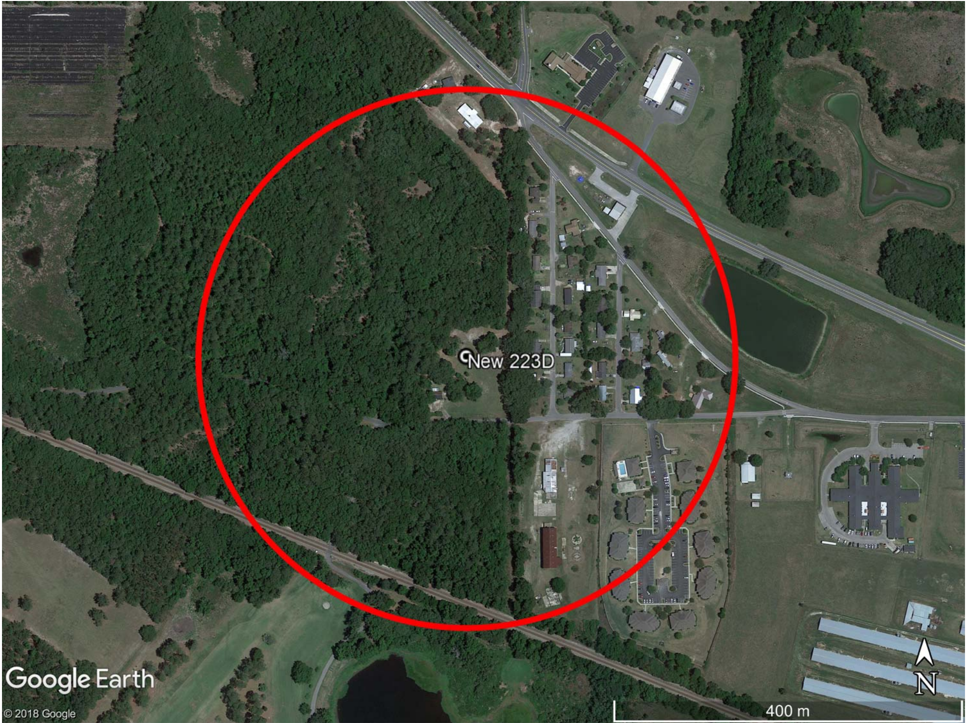
E-4 New 223D +40 111.02 F(50-10) dBu Contour Aerial Photo