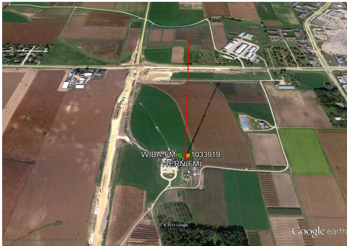
Figure 4. Aerial Image of Area Near Proposed Support Tower